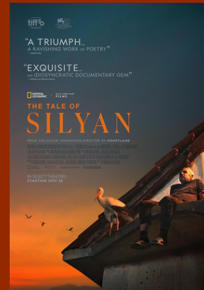
The Tale of Silyan 2025 Tamara Kotevska North Macedonia